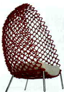
"Dragnet" lounge chair $19,800

Opening Hours: Mon-Sat 11am-8pm, Sun & PH 1pm-8pm