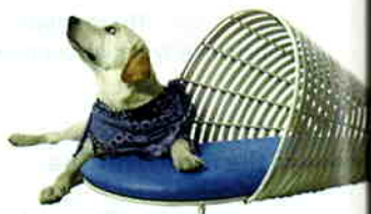
"Operetta" pet lounge $5,900