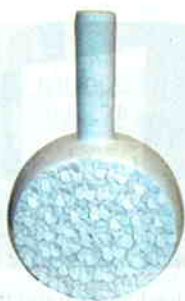
"Ball Belly" vase $1,280