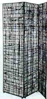
"C U C Me" folding screen $2,800