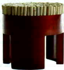
"Chiquita" stool $5,600