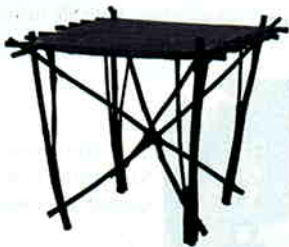
"Bando" end table $3,500