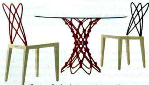
"Dragnet" side chair and dining table $3,600 and $7,500